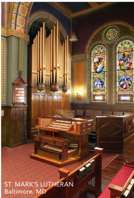
ST. MARK'S LUTHERAN Baltimore, MD

OUR TONAL PHILOSOPHY is to design and voice liturgical instruments that are intended to excite and to soothe the listener and harmonize with the room. Our liturgically based instruments are balanced to support choral and congregational singing by offering the maximum possibilities for sensitive and creative service playing. We believe that by offering organists comfortable registration possibilities for creative and sensitive service playing, and by having an essential grandeur and balance as needed, we can achieve the excitement necessary for effective worship.