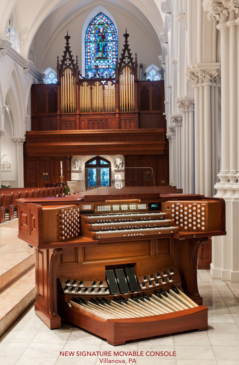
NEW SIGNATURE MOVABLE CONSOLE Villanova, PA