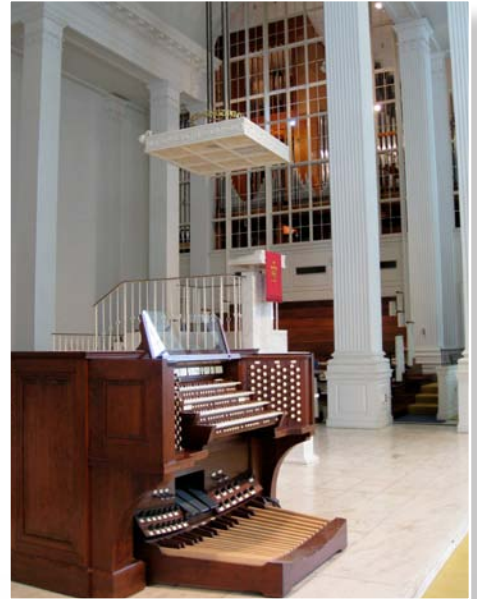
FIRST UNITED METHODIST CHURCH Orlando, Florida IV Manuals, 79 Ranks.

G IVEN THE ECONOMIC realities of the time in which we live, we welcome the opportunity to rebuild and modernize a client's existing instrument when it is of good manufacture. We retain the best pipework, revoiced as required, supplying additional new ranks to fill out the stoplist. Mechanical systems are rebuilt or replaced, and new consoles with state-of-the-art technology are provided.