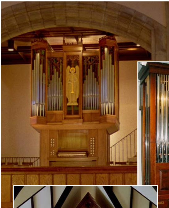
CHURCH STREET UNITED METHODIST CHURCH Stand alone II Manual Antiphonal Knoxville, Tennessee Main organ, IV Manuals, 82 Ranks <<

We believe the finest organ building in America today is being done in small shops such as ours, and we urge you to talk with our past clients about our dealings with them. We would be pleased to talk with you about an organ custom-designed and built to meet your musical and budgetary requirements, in any size from 2 ranks to 70 or more.