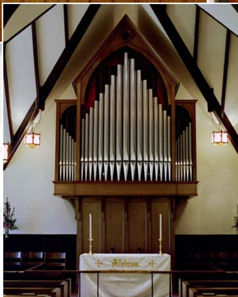
THE CURTIS INSTITUTE OF MUSIC Philadelphia, Pennsylvania Practice organ, II Manuals, 4 Ranks