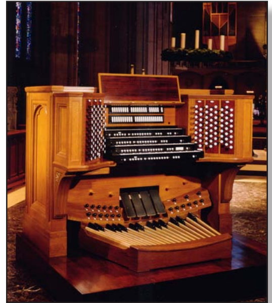
^ REPLACEMENT CONSOLE FOR GRACE CATHEDRAL, San Francisco, CA

ALTHOUGH WE ARE BEST KNOWN FOR OUR NEW ORGANS IN THE SYMPHONIC STYLE, WE ALSO RENOVATE FINE INSTRUMENTS OF OTHER BUILDERS.