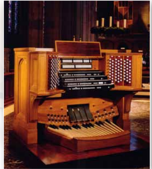
REPLACEMENT CONSOLE FOR GRACE CATHEDRAL San Francisco, CA

ALTHOUGH WE ARE BEST KNOWN FOR OUR NEW ORGANS IN THE SYMPHONIC STYLE, WE ALSO RENOVATE FINE INSTRUMENTS OF OTHER BUILDERS.