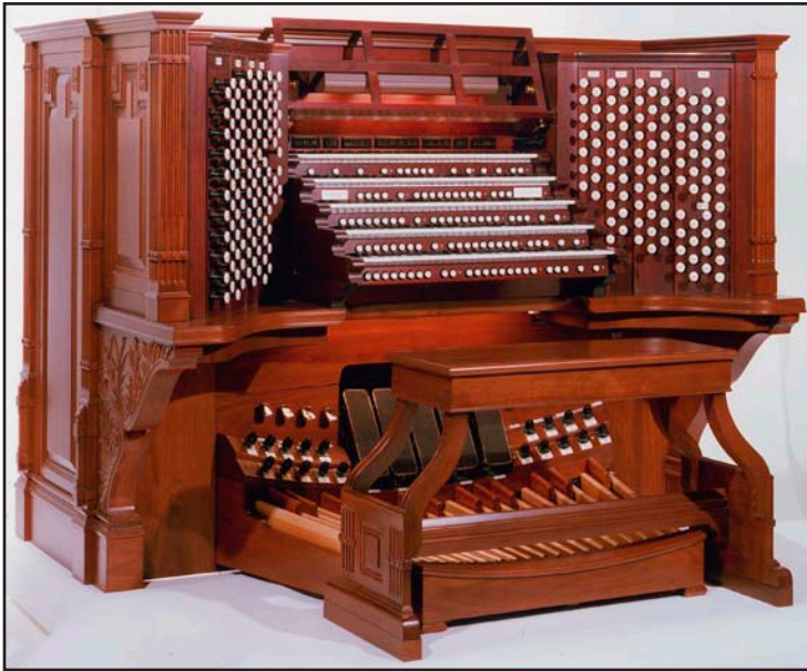
^ RENOVATED CONSOLE FOR THE MORMON TABERNACLE, Salt Lake City, UT