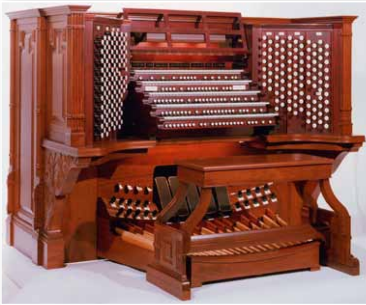
RENOVATED CONSOLE FOR THE MORMON TABERNACLE Salt Lake City, UT